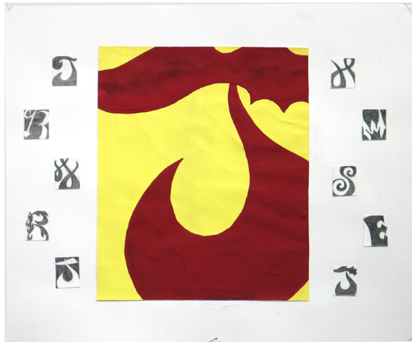
Student example of "C" work