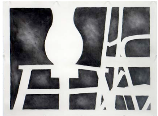
Has a better composition. The shapes that meet the border have interesting spaces to explore.