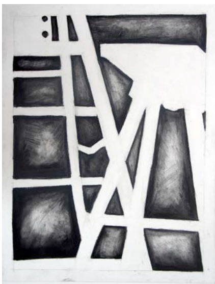
Nice composition, nice craftsmanship.