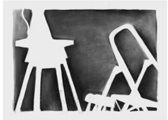
Fits the criteria of the assignment, but the composition is lackluster.

Do an outline drawing (as opposed to a contour drawing) of the negative shapes lightly in pencil. Once the entire layout is sketched out and spatially correct, fill in the negative space with charcoal. Play with smudging, scribbling, and smearing the charcoal until you find an aesthetically pleasing effect. Leave the positive shapes white.