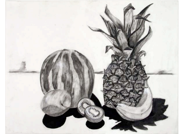
Brandy Eby (Spring '10)

IMPROVEMENT: Does the work show any development as compared to previous work?